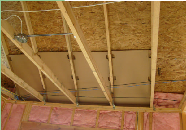
Attic Eave Baffles